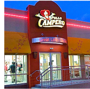
Most Successful New Business Award Pollo Campero